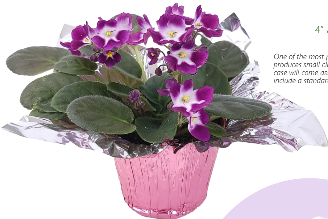
4" African Violet

One of the most popular indoor plants, the African Violet produces small clusters of flowers in various colors. Each case will come assorted with different colors and will include a standard pot cover.