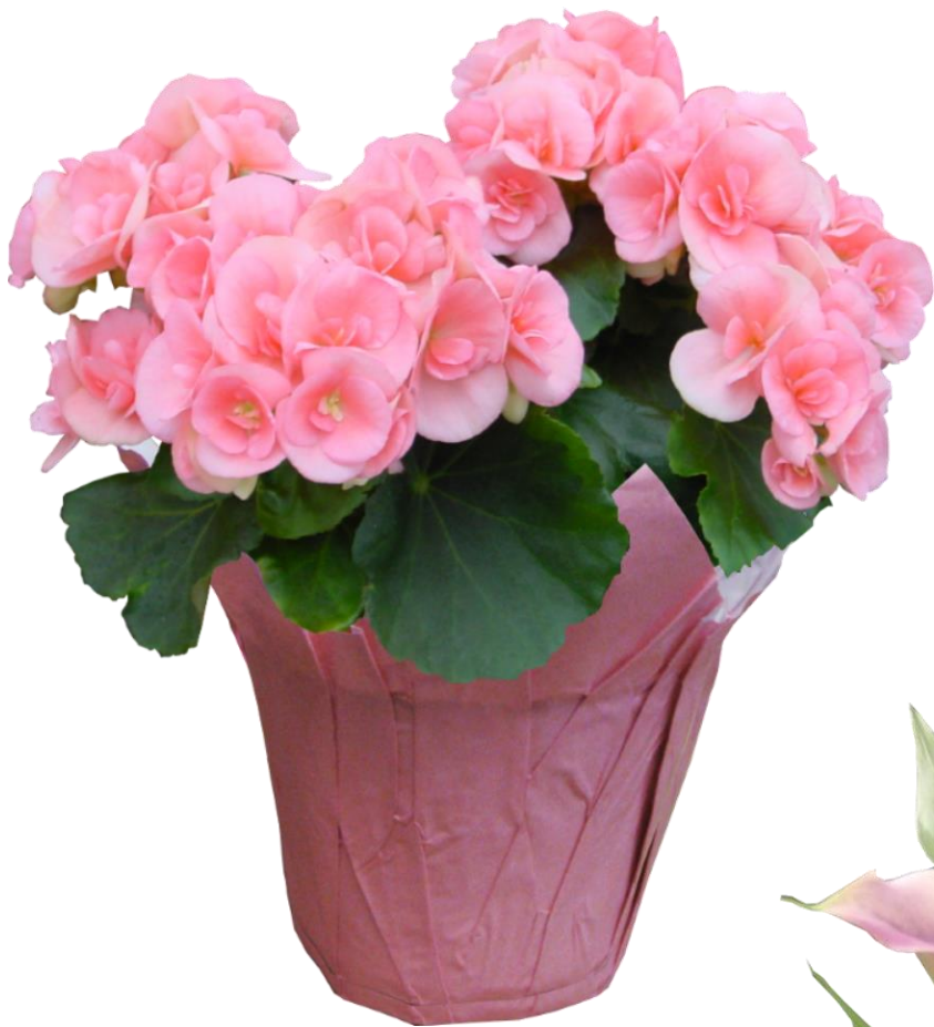
6.5" Rieger Begonia

A beautiful Rieger Begonia that will come in our standard pot cover. Each case will come with assorted bloom colors.