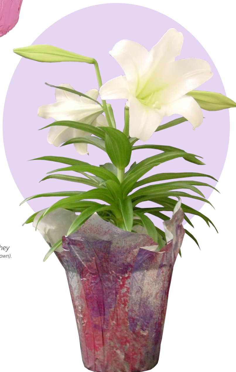
6" Easter Lily

One of the most popular indoor plants, the African Violet produces small clusters of flowers in various colors. Each case will come assorted with different colors and will include a standard pot cover.