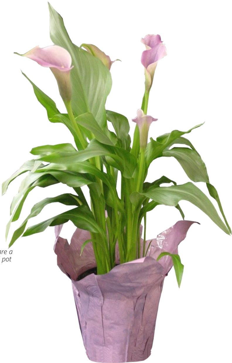
6.5" Calla Lily

A beautiful Rieger Begonia that will come in our standard pot cover. Each case will come with assorted bloom colors.