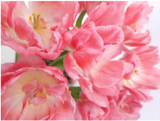
8" Flowering Bulb Washtub Planter

Absolutely stunning! Each washtub will come planted with unique varieties of Tulips (bicolor or fringed). Accented with Spanish moss.